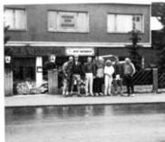
At the Pizzeria.