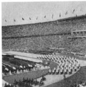
German Police Show.

In the blazing sun of what must have been one of the warmest days since July a crowd of about 100,000 people gathered in the Stadium on Sunday for the 'Große Polizeischau 1957'. For over six hours they were treated to a programme of non-stop entertainment provided by the Berlin City Police. At times the arena resembled the main hall at Crufts, as dogs dashed here and there barking wildly, at other times it reminded one of the Speedway Track of Bellevue, Manchester. Dogs, gymnasts and riders all contributed to a magnificent show.