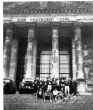
'A' Coy runners at the Reichstag.

The day culminated in a Company party at the Berlin Brigade Canoe Club where all the swimmers and runners were able to relax their weary bones.