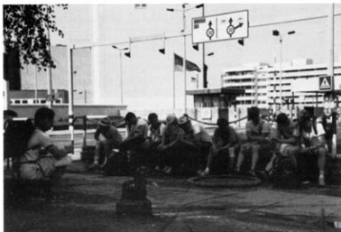
Resting at Checkpoint Charlie.

Wednesday, 26 August; 0600 hours; Smuts Barracks. Twelve members of 1st Troop stirred and thoughts turned to the three and a half day walk around the Berlin Wall. No-one was entirely sure of what to expect but morale was high. However, by 1615 hours on the first day 34 km had been completed.